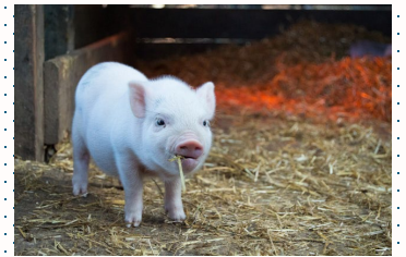
Sus scrofa domesticus