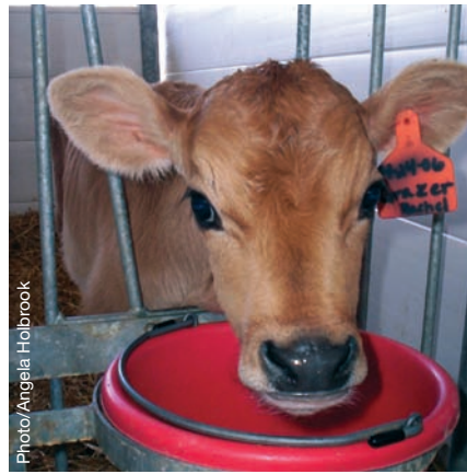
Jersey calf at Northeast Iowa Community-Based Dairy Foundation

Another valuable lesson that the students learned is that there isn't always one right answer, he said. The