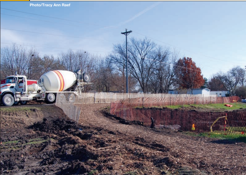
The student path from Old Orchard trailer park to the college was rerouted.