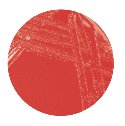
Propionibacterium acnes is now Cutibacterium acnes