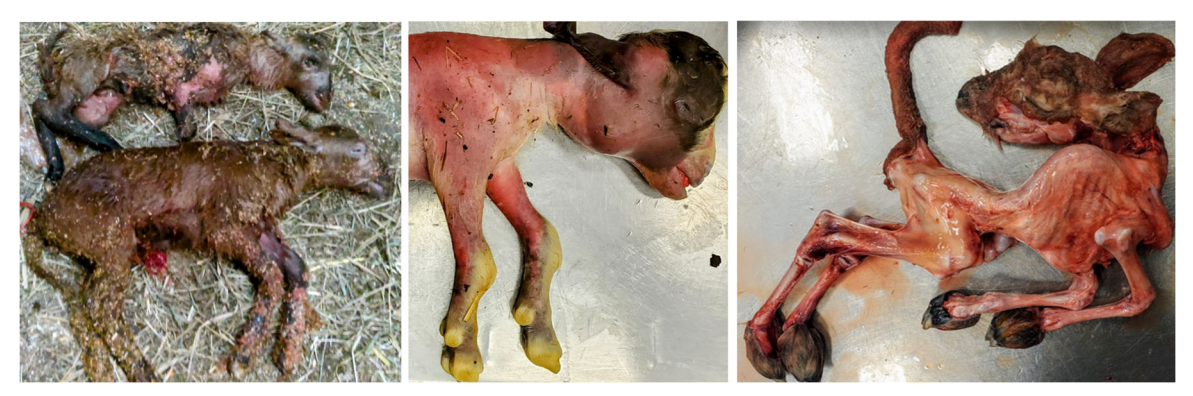
Figure 2: Examples of etiologically significant findings in fetal gross examination. Left: Asynchronous fetal death with presentation of a full-term stillborn fetus and a partially mummified immature twin associated with a Toxoplasma infection. Middle: Full-term fetus with sparse haircoat, superior brachygnathia and prominent bilateral firm enlargement of the thyroid (goiter) due to gestational iodine deficiency. Right: Fetus with arthrogryposis and scoliosis. Skin has been removed to demonstrate profound denervation muscle atrophy as a consequence of Cache Valley Virus infection.

- Placenta : Fetal membranes can be gently rinsed to remove debris and screened for evidence of infection (Figure 3). Normal small ruminant placentas feature a thin transparent intercotyledonary membrane with prominent chorioallantoic blood vessels. Adjacent cotyledons should be of similar size and color, although progressively decreasing size and necrotic tips can be observed at the distal extremes. Color can vary depending on duration of retention and degree of blood breakdown, however, sharp variation in cotyledon color or