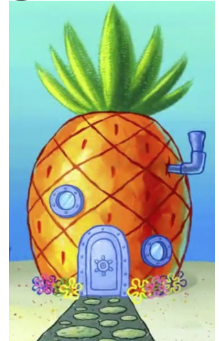
Housing Usually provided at no cost to student