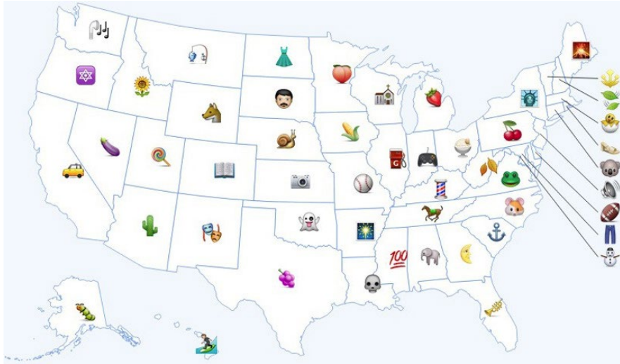
Location – wherever we get hosts lined up