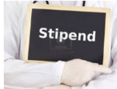
Stipend for 2025 is $575/week