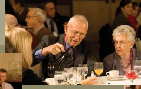
Celebratory Breakfast

by the university and the college on Oct. 24.