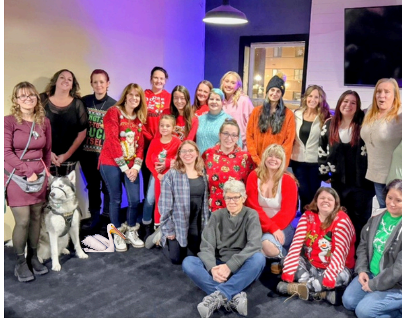
Animal of the Month: American White Pelican Pelecanus erythrorhynchos