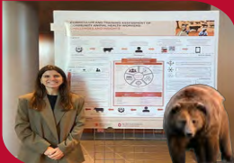
Animal of the Month: Kodiak Bear Ursus arctos middendorffi